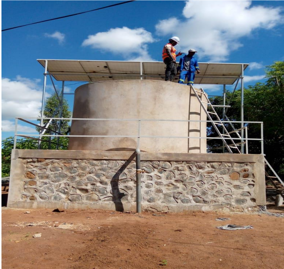
30,000 liter concrete storage tank