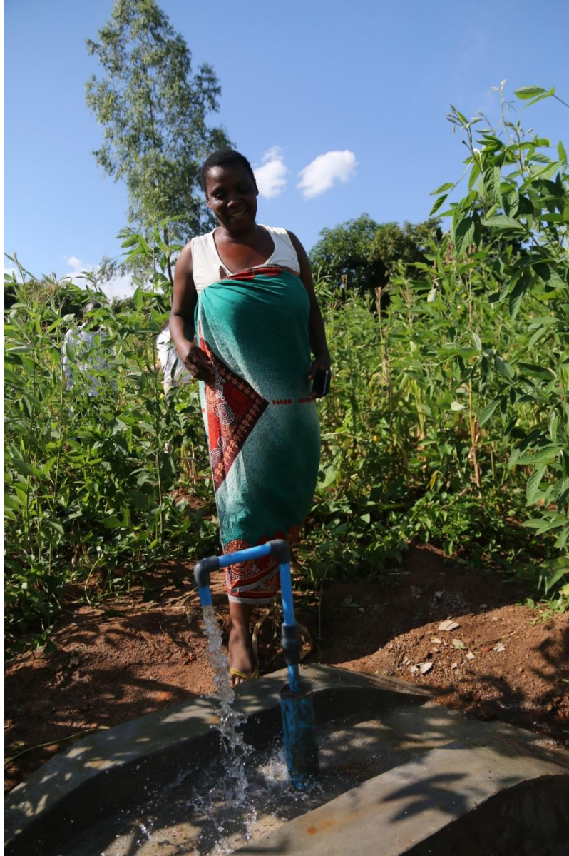
A happy farmer