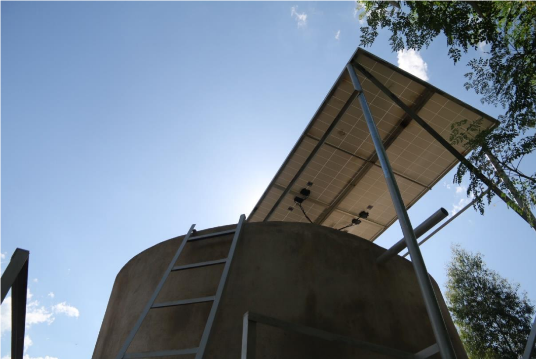
Tank with solar panels above