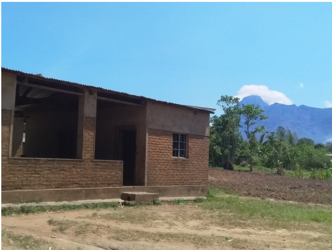
The old building at Chidyangombe

The previous building was in a very poor state and environmental assessment (2019) advised for the building to be broken down and rebuilt.