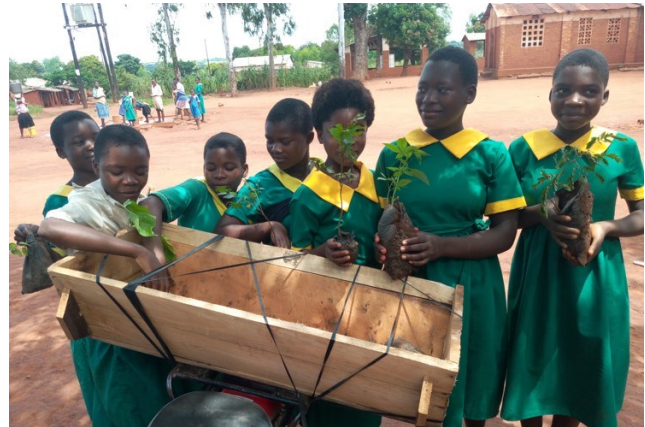
Pupils with seedlings and beehive