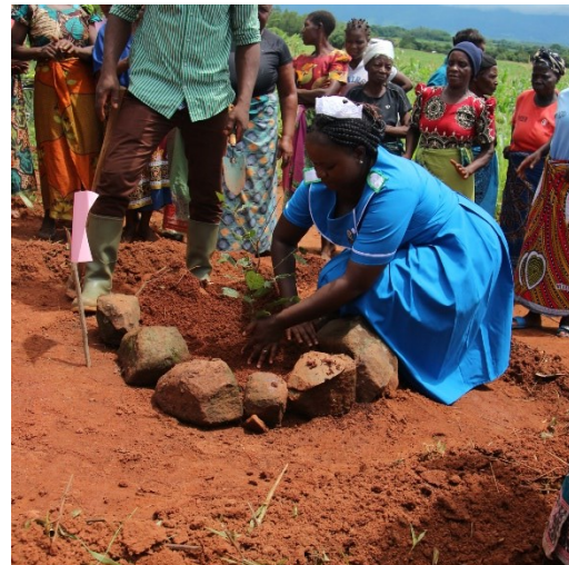
The hospital matron planting an indigenous tree – opening ceremony