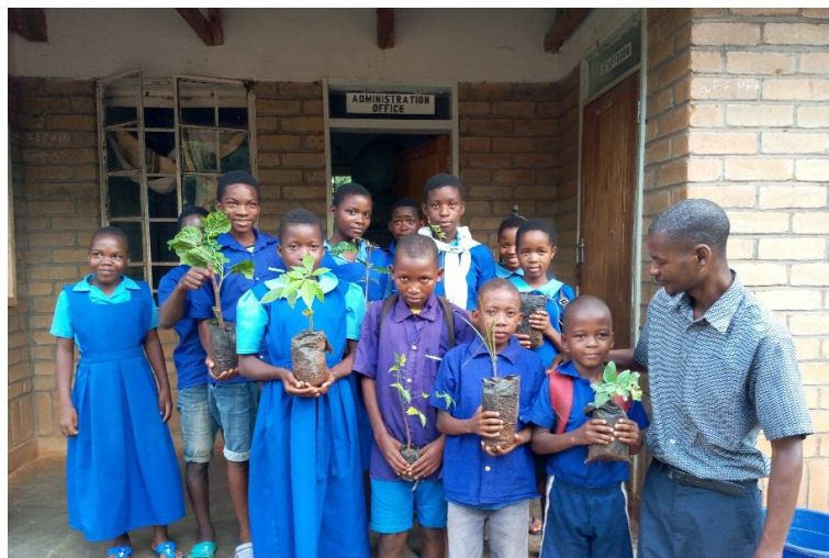
Schoolteacher and pupils

In addition, individuals and companies who had compensated carbon emissions received certificates. Their contributions were used too, and realized 25 tonnes of CO 2 captured.