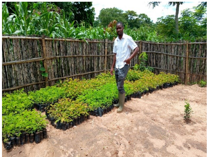
Salamba Community tree nursery

The establishment of By-laws in the catchment area will assist in the protection of the trees and the environment. Currently, the Misanjo Community have formulated by-laws which are due to be presented to the entire community by the end July, 2020.