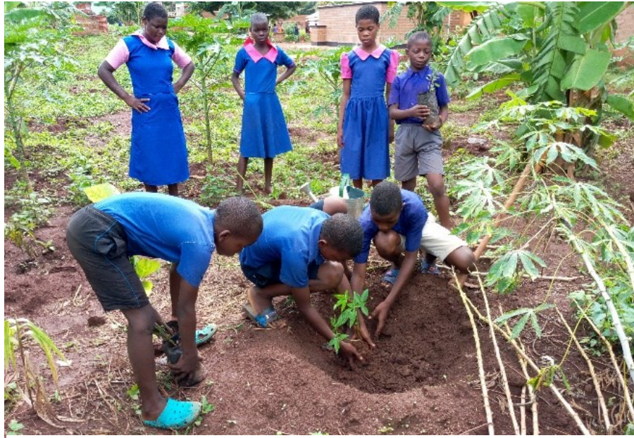
Pupils at Misanjo Primary School planting fruit trees in the school orchard