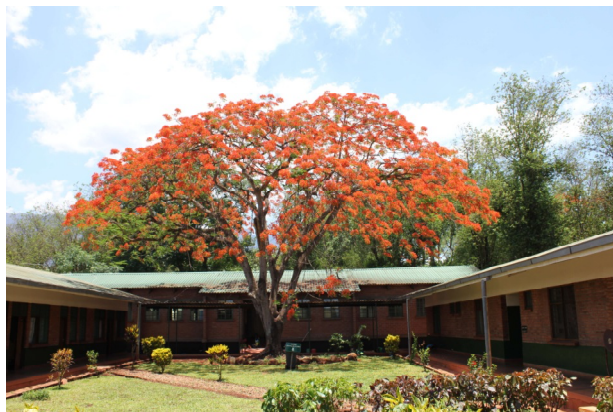
Flame tree in the maternity courtyard