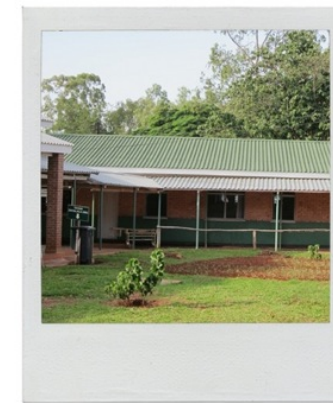
Early morning view of Mulanje Mountain from the Hospital

Mulanje Mission Hospital PO Box 45, Mulanje, Malawi info@mmh.mw www.mmh.mw