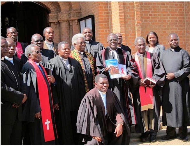
Blantyre Synod recently adopted new workplace guidelines on HIV and AIDS