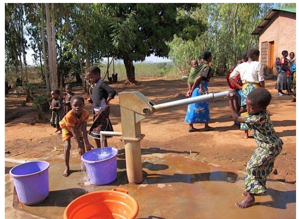
Children busy with the pump at Salamba Clinic